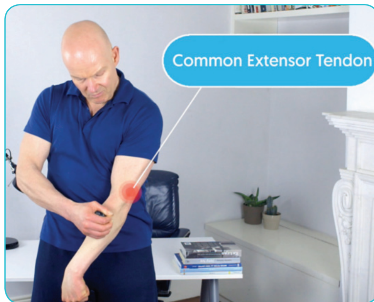
figure 1 - Origination point of the forearm [extensor] tendon responsible for Tennis elbow pain and discomfort

This is a painful condition typically aggravated by tension in the wrist and finger extensor muscles located in the forearm [posterior]. These muscles can shorten in length due to a variety of factors such as age; poor work posture; repetitive strain; general over-use or a reduction in blood flow from injury and will usually result in pain, general discomfort and inflammation in the tendon which connects them to the elbow joint [figure 1].