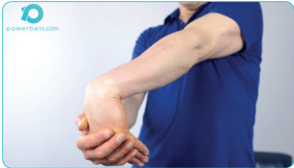
figure 6 - Gently stretch the hand backward as illustrated

Further details and a full video of this Powerball® Tennis Elbow rehabilitation program may be found on the powerballs.com website.