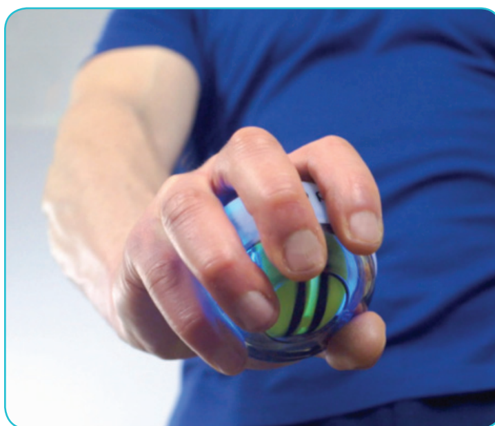
figure 2 - Power grip

It is very important that you spin only with your wrist and not the arm - rotating clockwise or anticlockwise as preferred.