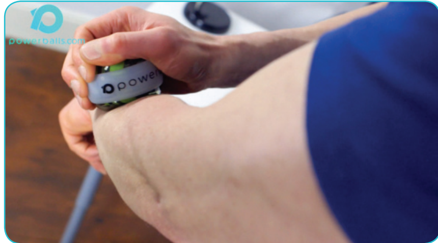
figure 3 - Powerball® presented flat to the arm

Continue this action for at least 2-3 minutes until the tissue has been fully loosened out and sensitivity now fades in the muscle.